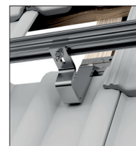
Double Roman Tiles